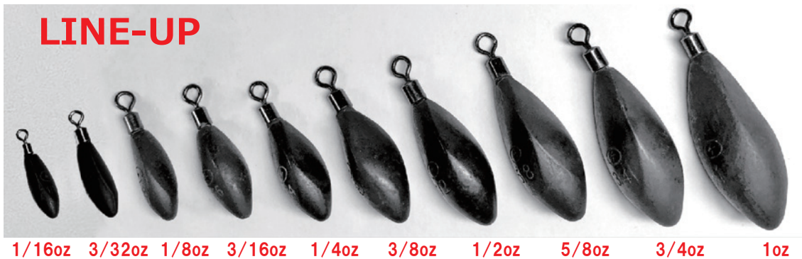
1/16oz 3/32oz 1/8oz 3/16oz 1/4oz 3/8oz 1/2oz 5/8oz 3/4oz 1oz

Although it's pure tungsten, it doesn't glitter. The mat finish weakens inappropriate reflections and lessens the rig's strangeness increasing a natural look. The broad line-up accommodates to various situations. The engraved weight description is quite handy.