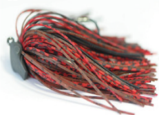
#14 Election Makkachin