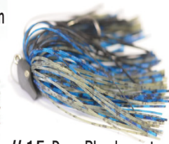
#15 Deep Blue Impact