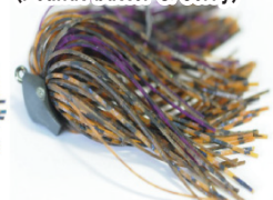
#16 PBJ (Peanut butter & Jerry)

CORK SCREW WORM KEEPER & WIRE KEEPER specification